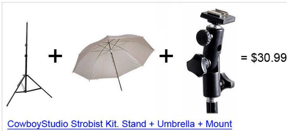
CowboyStudio Strobist Kit. Stand + Umbrella + Mount

With this kit, you get a stand, some diffusion material (a shoot through umbrella), and a mount, so you can mount your flash on the stand. Having the stand will eliminate the need for someone else to hold the flash for you. This kit is only $30.99!