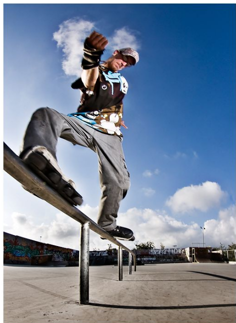
1 flash on the right (tripod held)